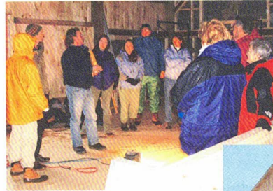
The Ecology Center is located on the Cathance River Preserve in Topsham.

The Ecology Center will be semi-operational for the 2006 school year.