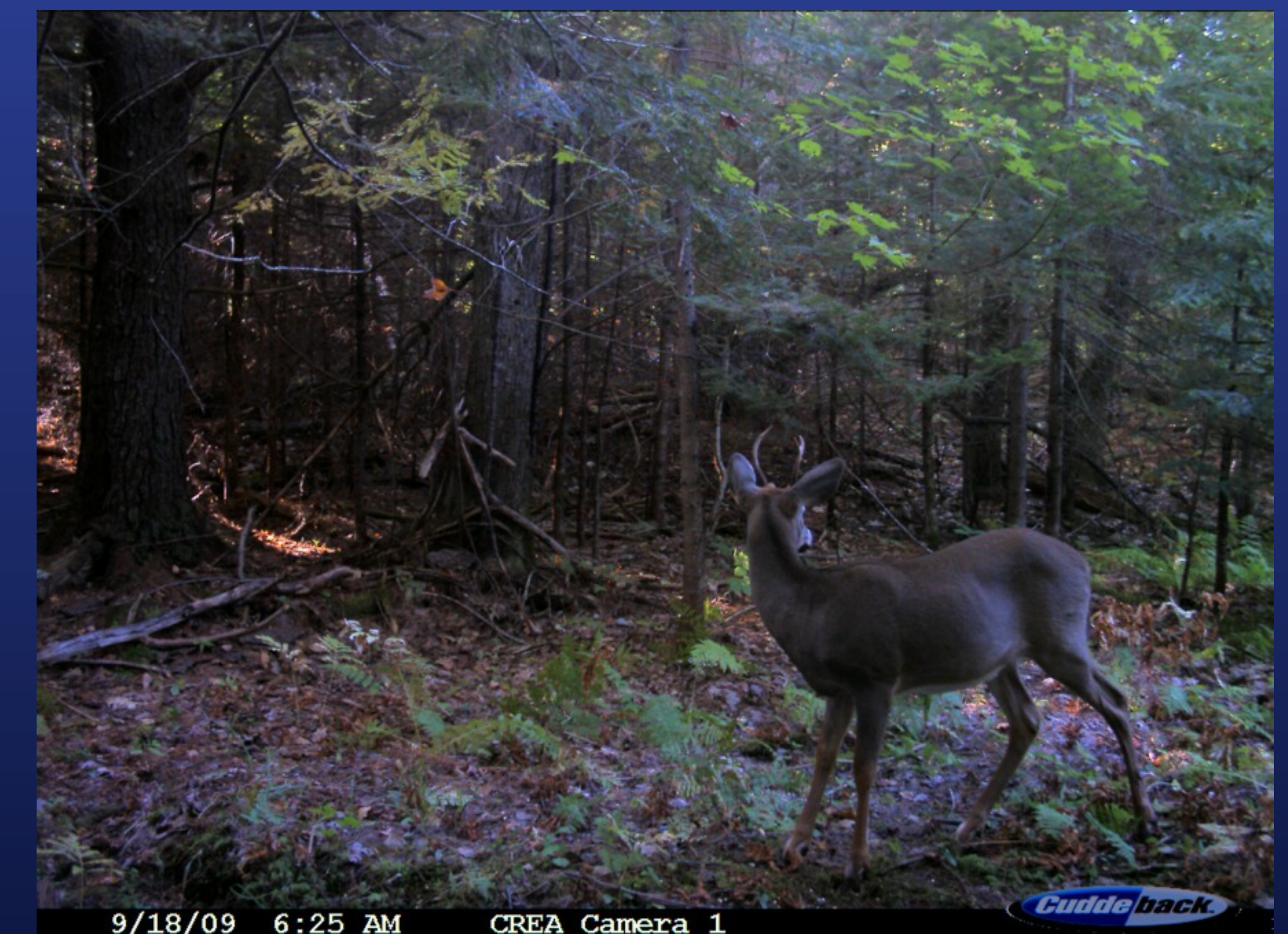
White Tail Deer