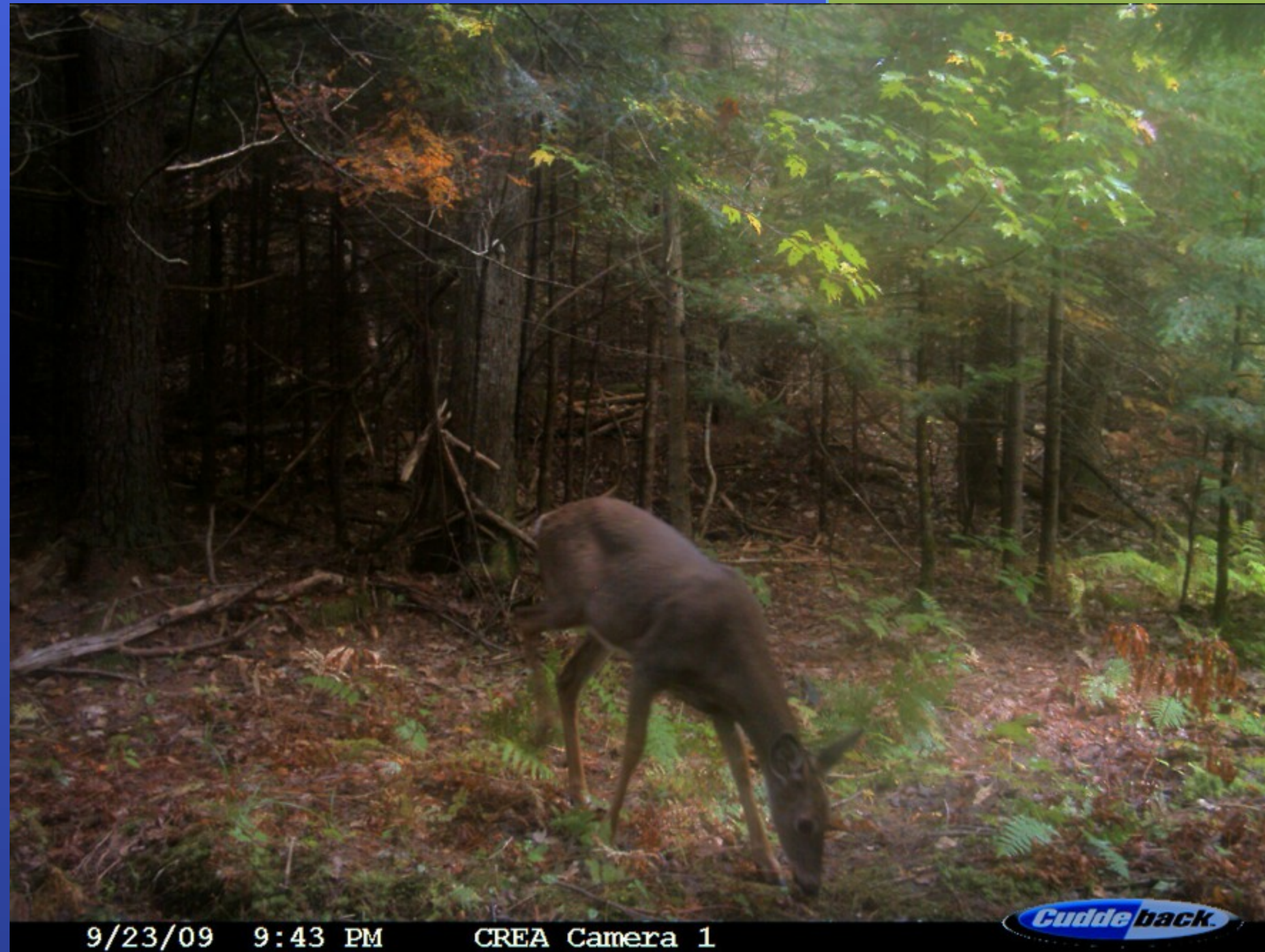
White Tail Doe