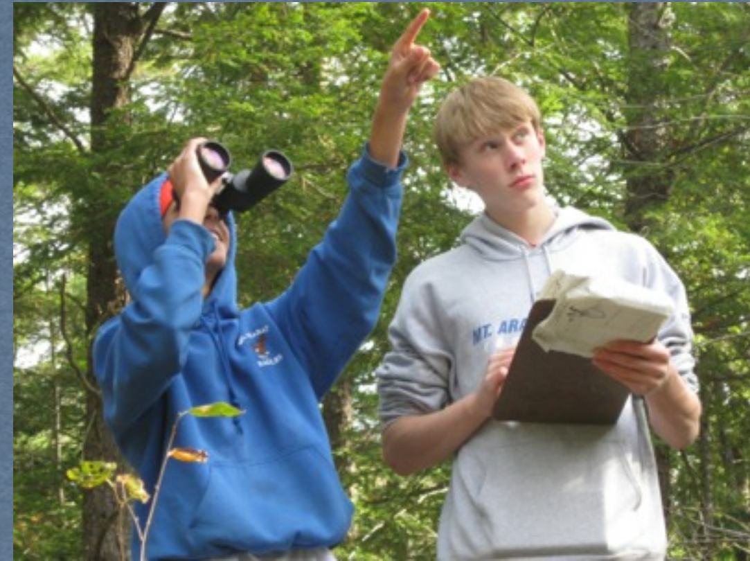
Researchers Observing a Bird

The purpose was to see how colder weather and climate conditions affected the amount of different species of birds seen and heard. Every Thursday the researchers traveled to the Cathance River Preserve to observe and record birds seen. The researchers walked the same path each week, on which many different species of bird were seen. Each week the temperature and conditions varied, and seemed to have effects on the amount of birds seen and heard. Based on the data found, there were more birds and more bird species on the colder days.