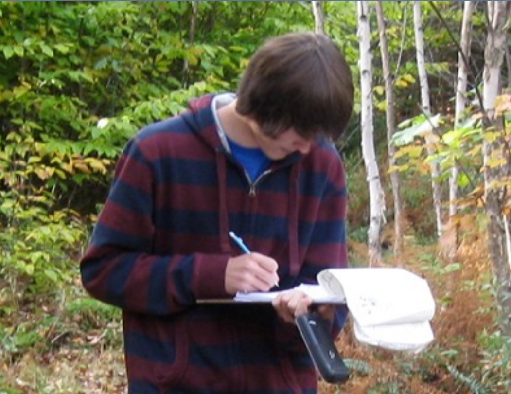
Researcher Taking Notes